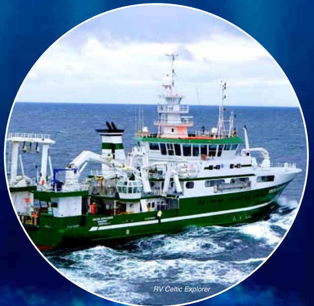
RV Celtic Explorer